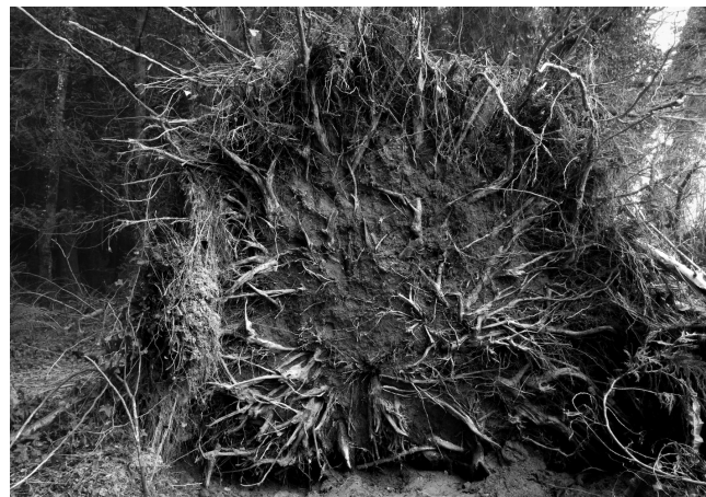
Debra Solomon, Entropical / En Necromasse , forest root, 2015

Entropical is a research project started in 2015, the international year of the soil. This first presentation of Entropical consists of four art works in which the value and dynamics of the exchange of materials in the biological world is set against the abstract value of algorithms and computer calculations. How can we bring these value systems into a direct productive relationship in a time in which intensive computation is valued far more than ecological regeneration? How, for example, can Bitcoin positively affect the rhizosphere, the layer of earth around the roots of plants?