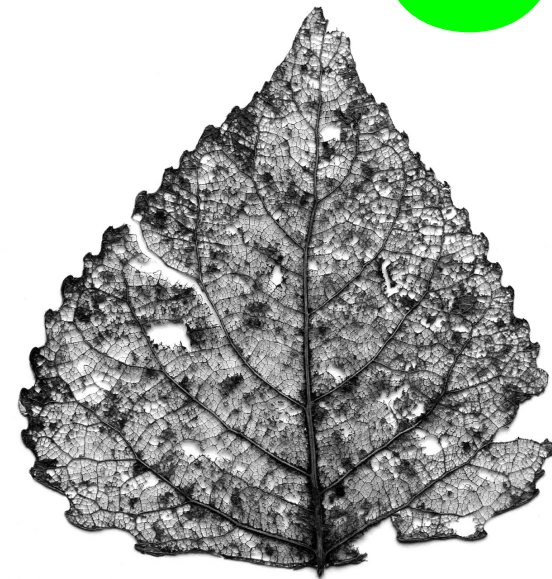
Debra Solomon, Entropical / En Necromasse , leaf skeleton, 2015

www.entropical.org www.urbaniahoeve.nl www.dyne.org