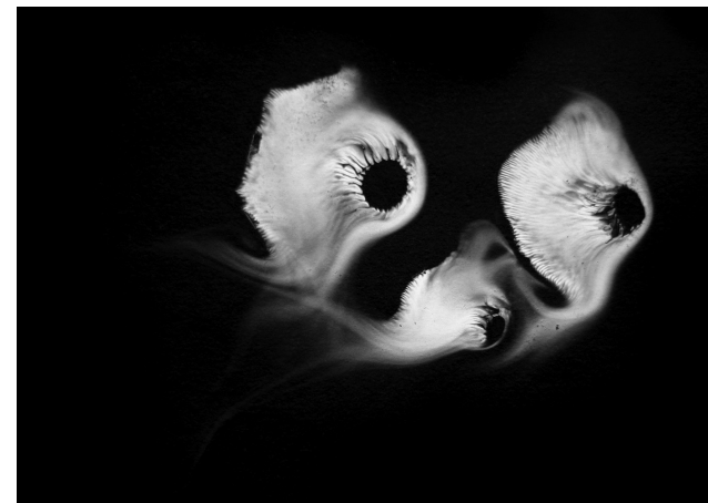
Debra Solomon, Entropical / En Necromasse , spore print, 2015