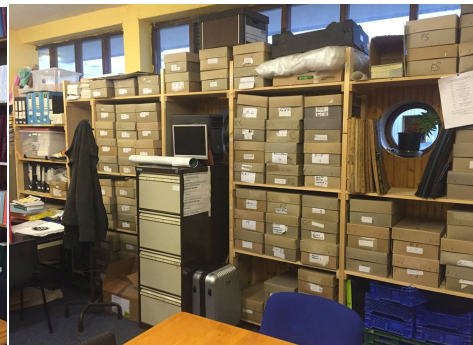
Inside the Society's Archive & Research Centre in Dún Laoghaire